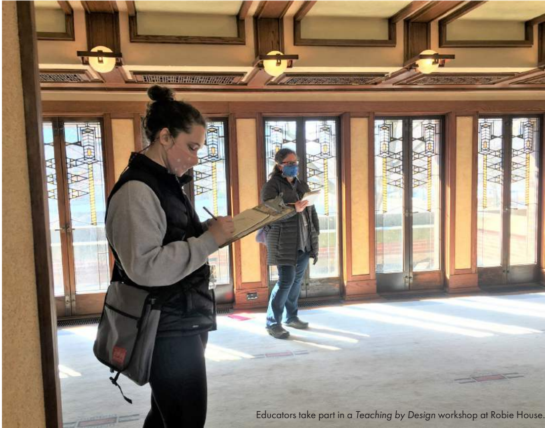
Educators take part in a Teaching by Design workshop at Robie House.

In 2020, the Trust received two 3-year grant awards for Teaching by Design , from the Institute of Museum and Library Services (IMLS) and the Terra Foundation for American Art.