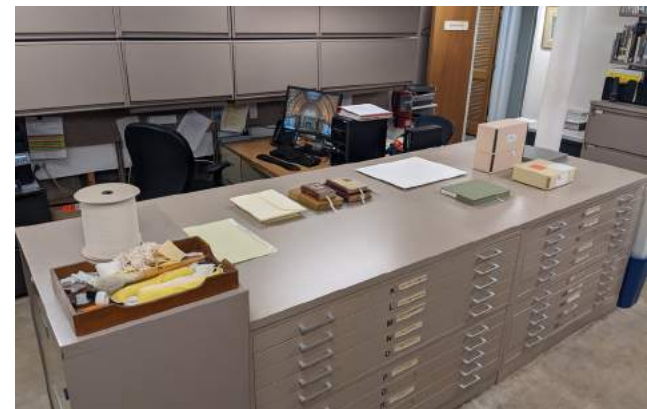
Frank Lloyd Wright Trust, Research Center, Library and Archive.