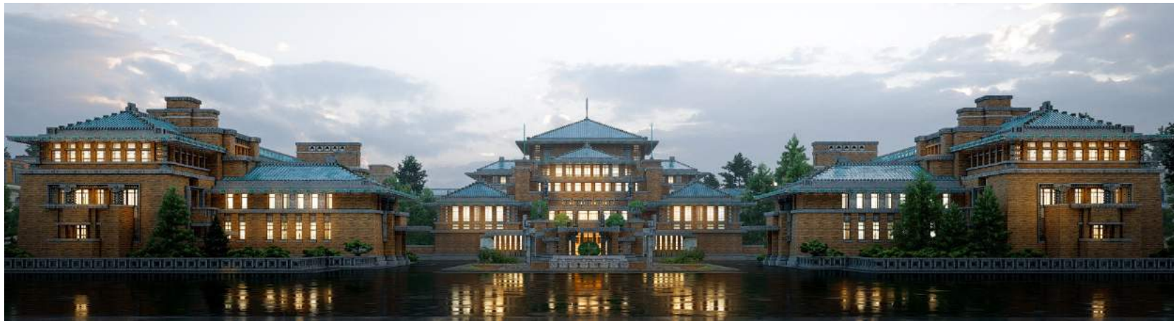
Wright Night attendees previewed Frank Lloyd Wright: The Lost Works - The Imperial Hotel, a digitally-animated recreation of the exterior and interior of this masterpiece.