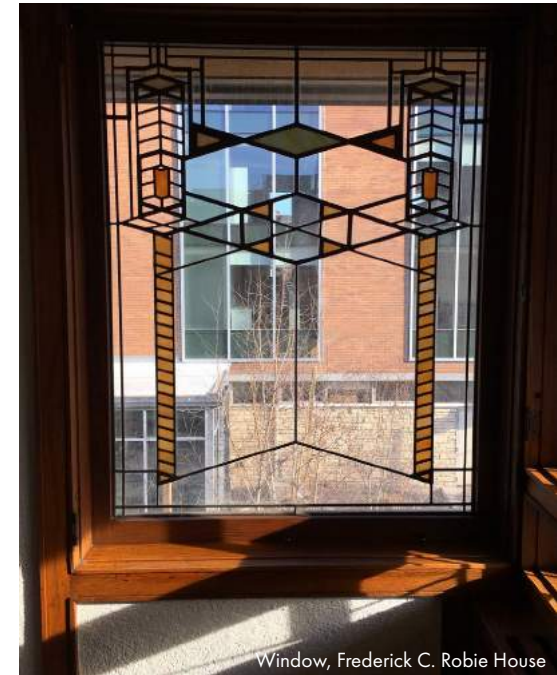
Window, Frederick C. Robie House

Developing the Trust's resources and maintaining the Trust's financial stability in order to sustain Wright's original sites for future generations and ensure a lasting and secure future for the Trust, supported by strong community and business relationships and by dynamic Board engagement.