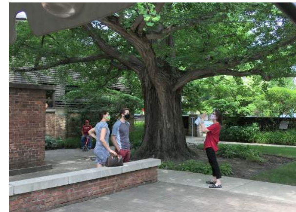
Socially distanced tours at the Home and Studio began in the courtyard.