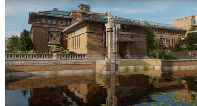
Imperial Hotel digital visualization.