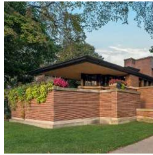
Frederick C. Robie House 5757 S. Woodlawn Ave, Chicago, IL