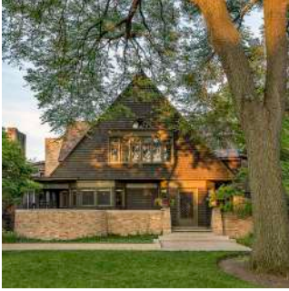
Frank Lloyd Wright Home and Studio 951 Chicago Ave, Oak Park, IL