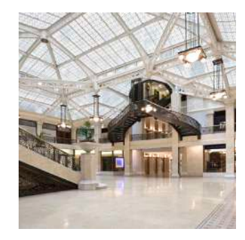
Rookery Light Court 209 S. LaSalle St, Chicago, IL