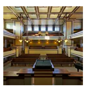
Unity Temple 875 Lake St, Oak Park, IL