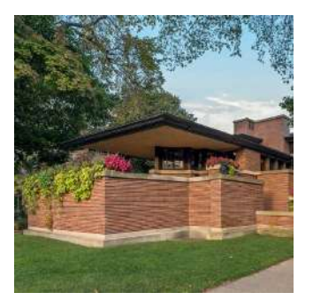
Frederick C. Robie House 5757 S. Woodlawn Ave, Chicago, IL