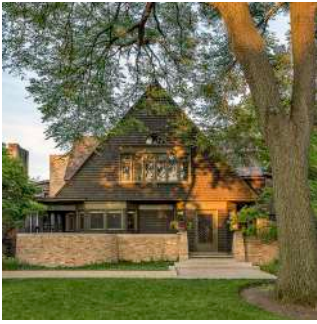
Frank Lloyd Wright Home and Studio 951 Chicago Ave, Oak Park, IL