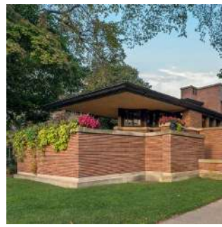
Frederick C. Robie House 5757 S. Woodlawn Ave, Chicago, IL